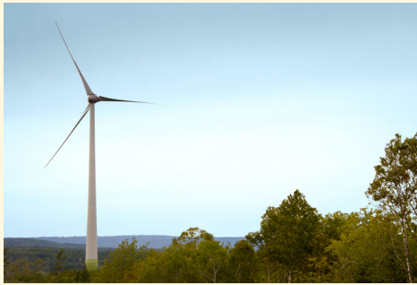
Figure 1.2 —Below is a sampling of community-based green energy projects Bullfrog Power is helping to fund across Canada. To date, the company has provided funding to more than 130 of these projects across Canada.

Bullfrog Power financially supported the Ellershouse Wind Farm in Nova Scotia, the first wind development in N.S. to be funded and built independently of the local power authority or any provincial government incentive program.