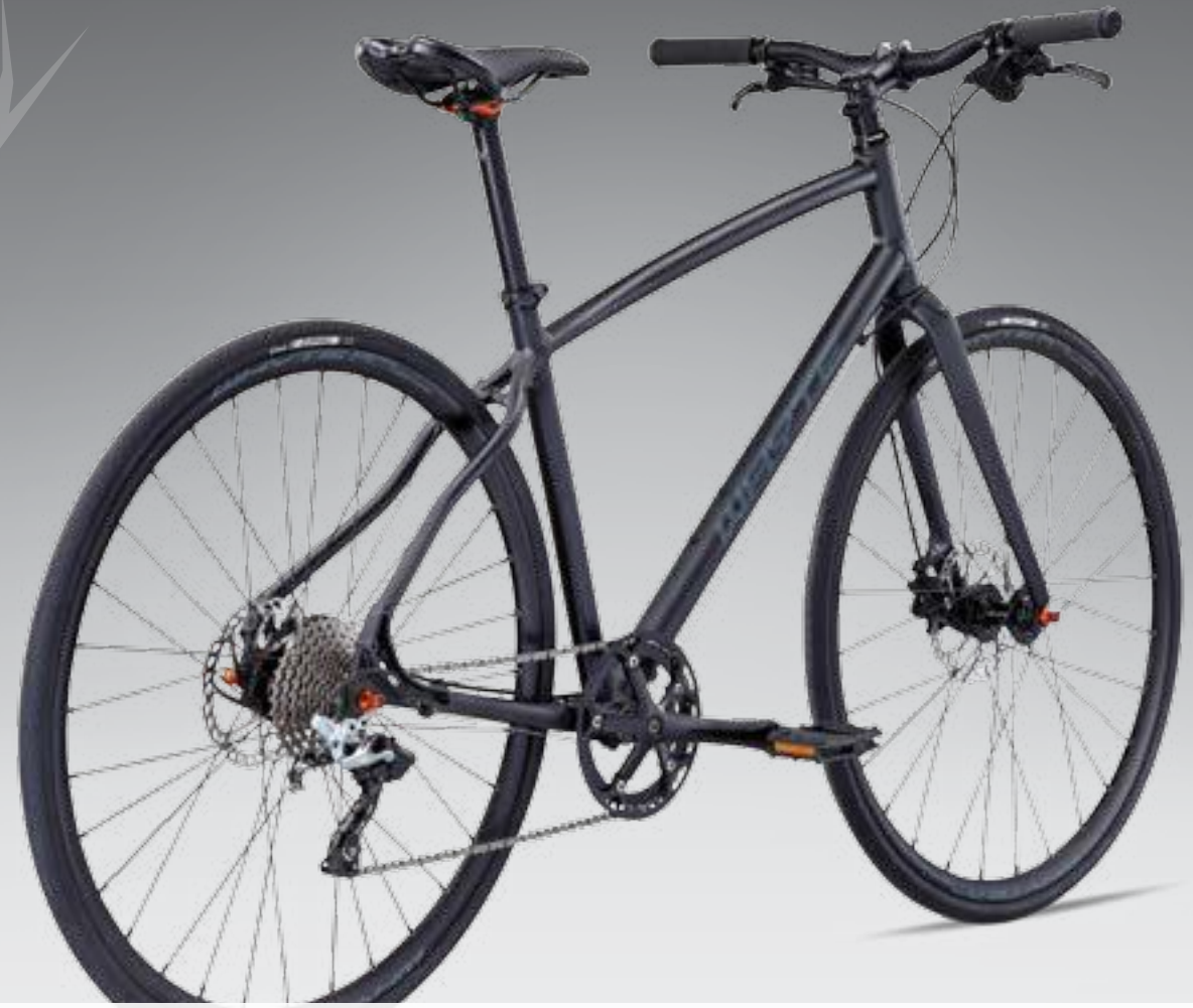
Lightweight aluminium frame / 1x10spd Shimano mountain bike gearing for city-proof performance / Reliable and powerful Tektro hydraulic disc brakes R7 FAST URBAN SERIES

VICTORIA WOMEN'S TYPICAL USAGE: URBAN COMMUTER