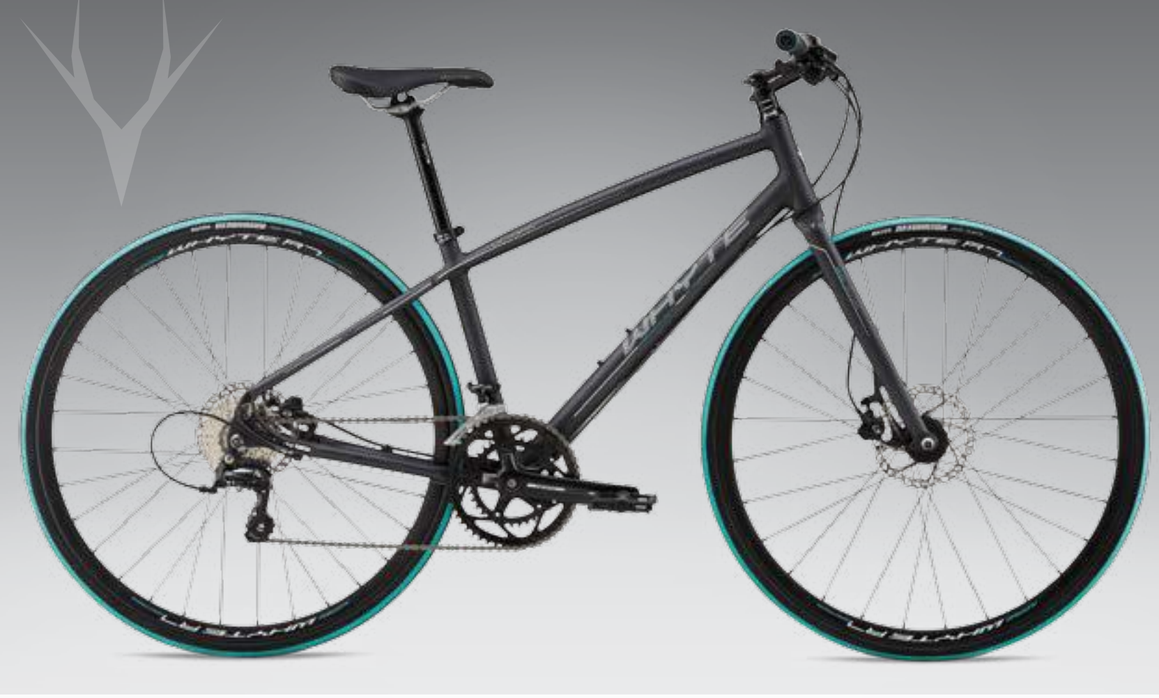
Lightweight aluminium frame with compact geometry / Shimano 2x9spd drivetrain / Maxxis Detonator tyres with puncture protection R7 FAST URBAN SERIES