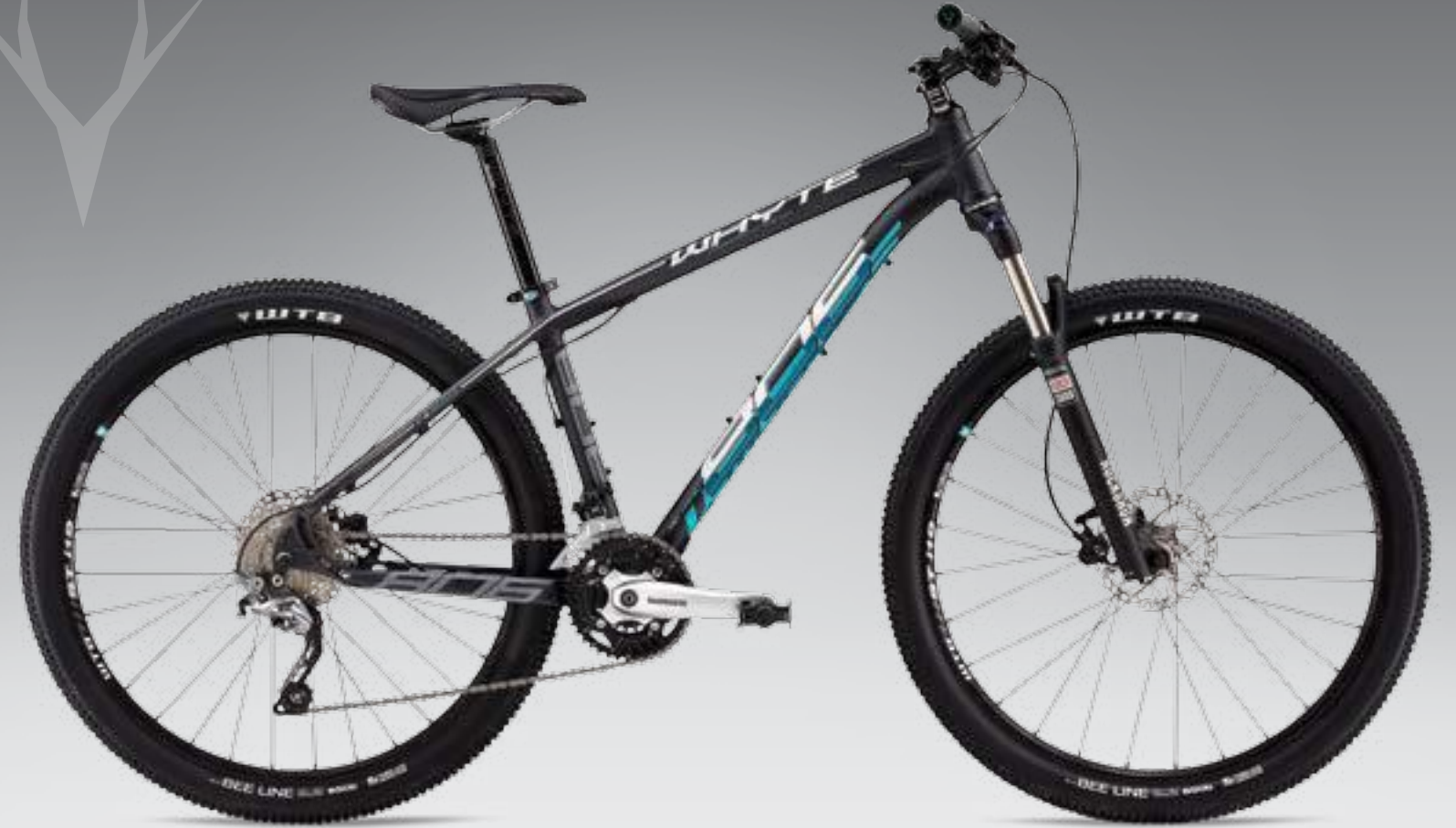
Shimano Deore 3x10spd drivetrain / Compact geometry and sizing down to XS for smaller riders / Adjustable air-sprung Rockshox XC-30 suspension fork X-8 PERFORMANCE HARDTAIL 650B / 27.5"