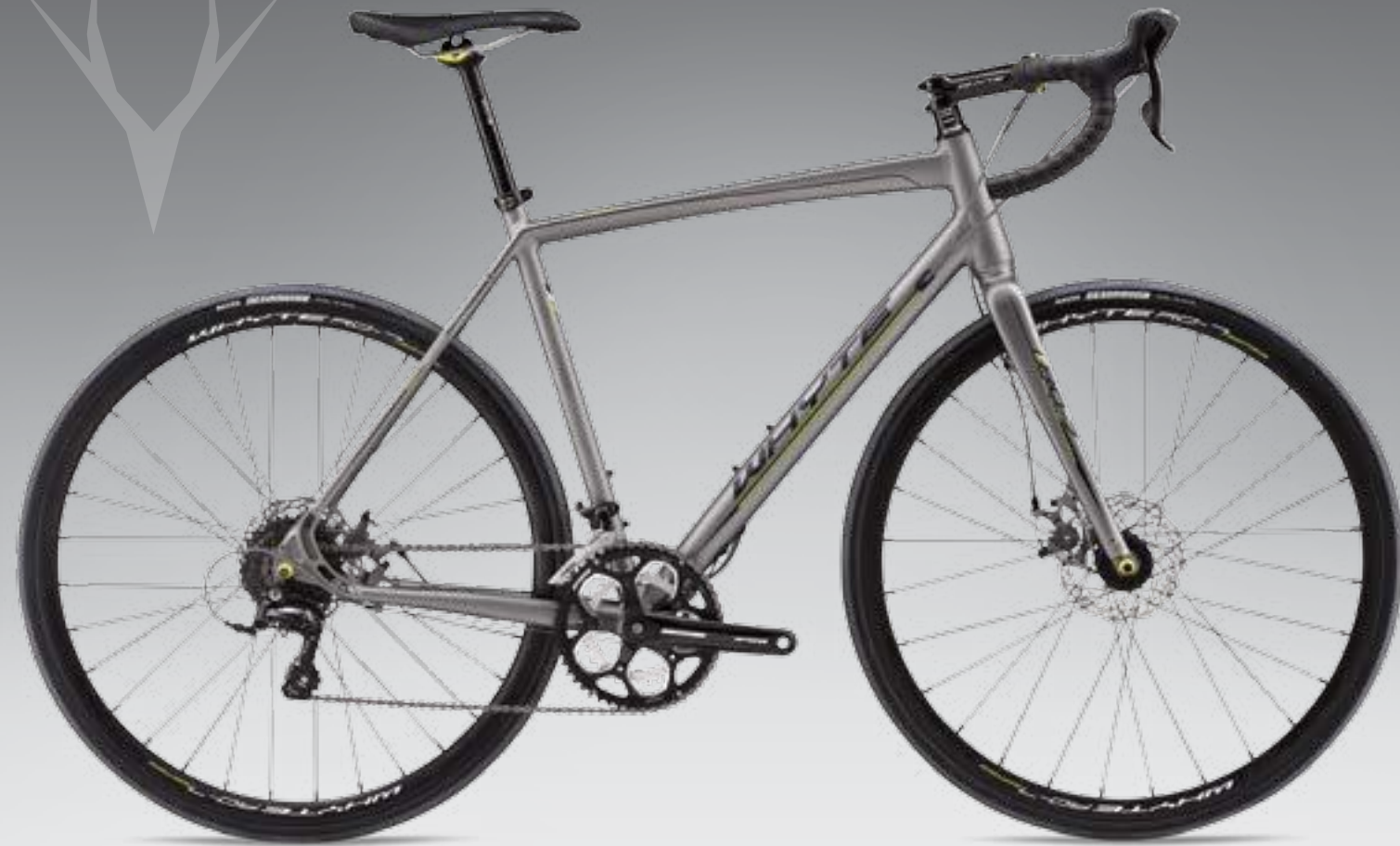
Lightweight disc-specific aluminium frame with alloy fork / Shimano 9spd compact gearing with wide range rear cassette / Powerful mechanical disc brakes RD-7 ROAD DISC

DORSET TYPICAL USAGE: COMMUTER / ANYROAD