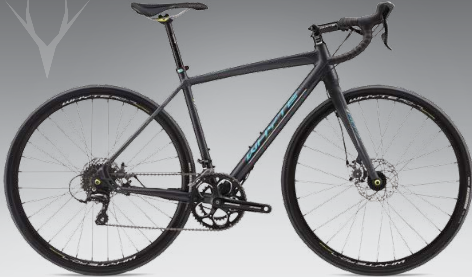
Lightweight disc-specific aluminium frame with alloy fork / Shimano 9spd compact gearing with wide range rear cassette / Powerful mechanical disc brakes RD-7 ROAD DISC

DEVON WOMEN'S TYPICAL USAGE: COMMUTER / ANYROAD