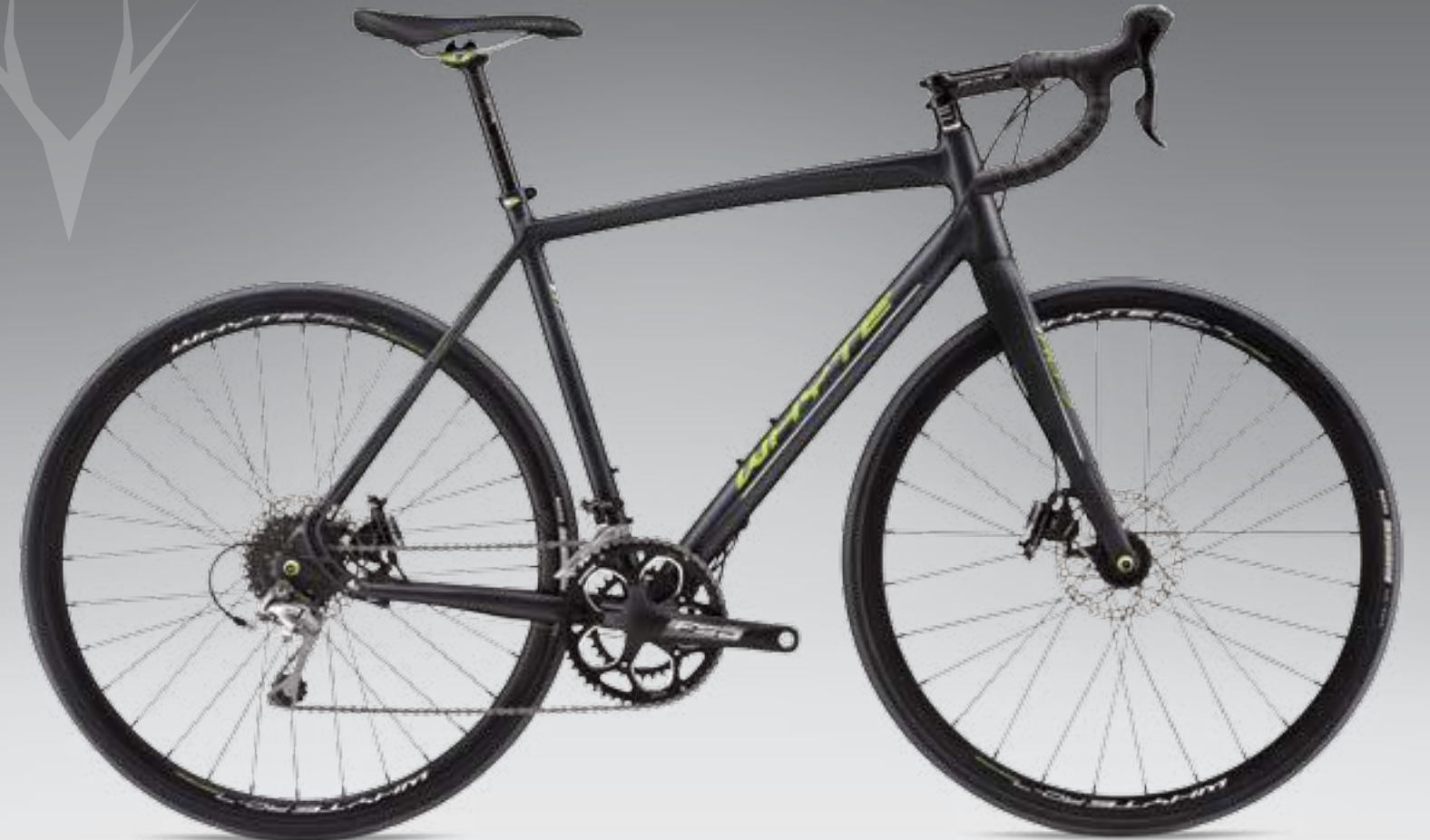
Disc-specific aluminium frame with carbon fibre fork / TRP HyRd mechanical/hydraulic disc brakes / Shimano Sora 9spd compact gearing with wide range rear cassette RD-7 ROAD DISC