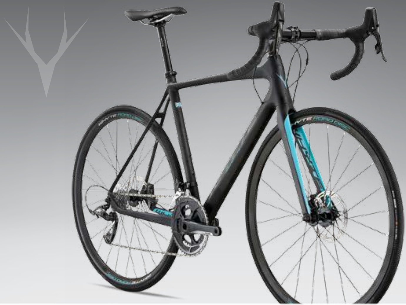
Uni-directional multi-monocoque carbon frame with carbon fork / SRAM Rival 11spd drivetrain / SRAM Rival hydraulic disc brakes with 160mm rotors.