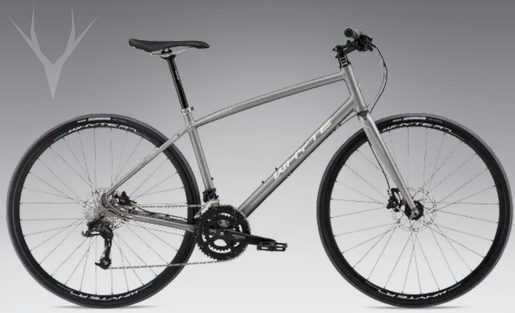
Carbon fibre fork with lightweight aluminium steerer tube / Lightweight aluminium frame with compact geometry / SRAM's Via Centro 2x10spd urban drivetrain R7 FAST URBAN SERIES