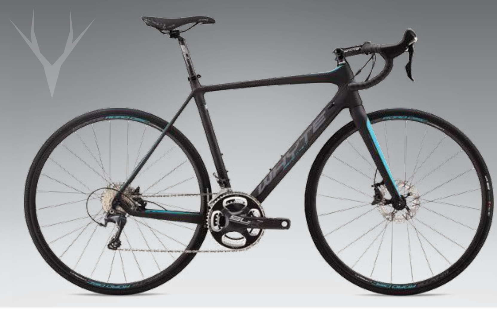
Shimano Ultegra 11spd groupset including Ultegra full-hydraulic disc brakes / Uni-directional multi-monocoque carbon frame with carbon fork / Whyte Road Disc carbon wheelsset.