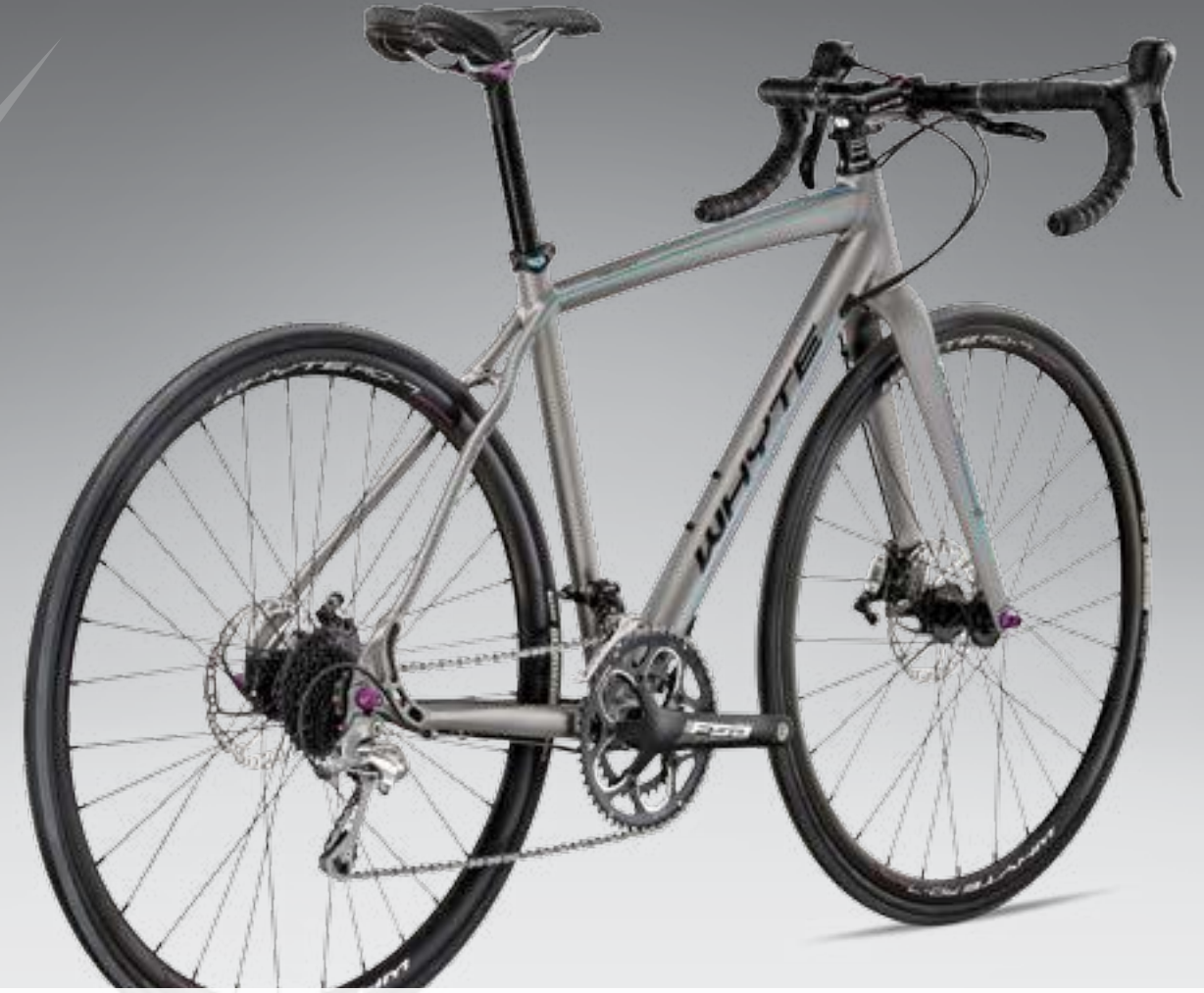
Disc-specific aluminium frame with carbon fibre fork / TRP HyRd mechanical/hydraulic disc brakes / Shimano Sora 9spd compact gearing with wide range rear cassette RD-7 ROAD DISC