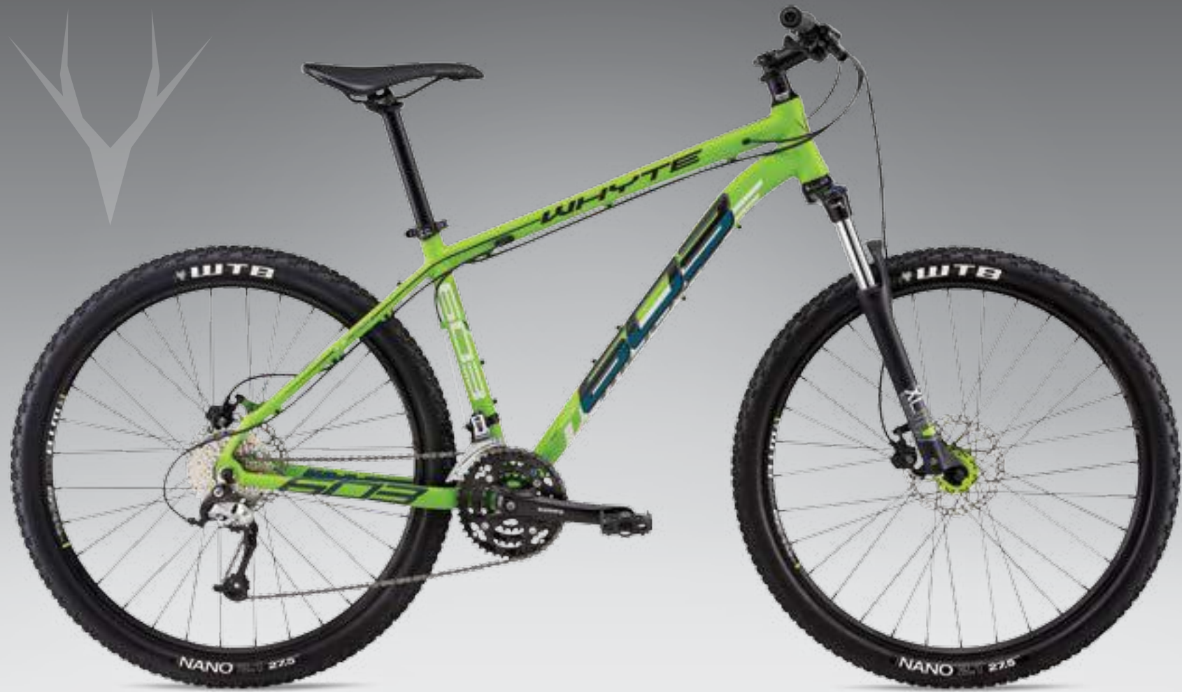
Lightweight aluminium frame with internal cable routing / SR Suntour suspension with lockout feature / Tektro Auriga hydraulic disc brakes X-6 SPORTS HARDTAIL 650B / 27.5"