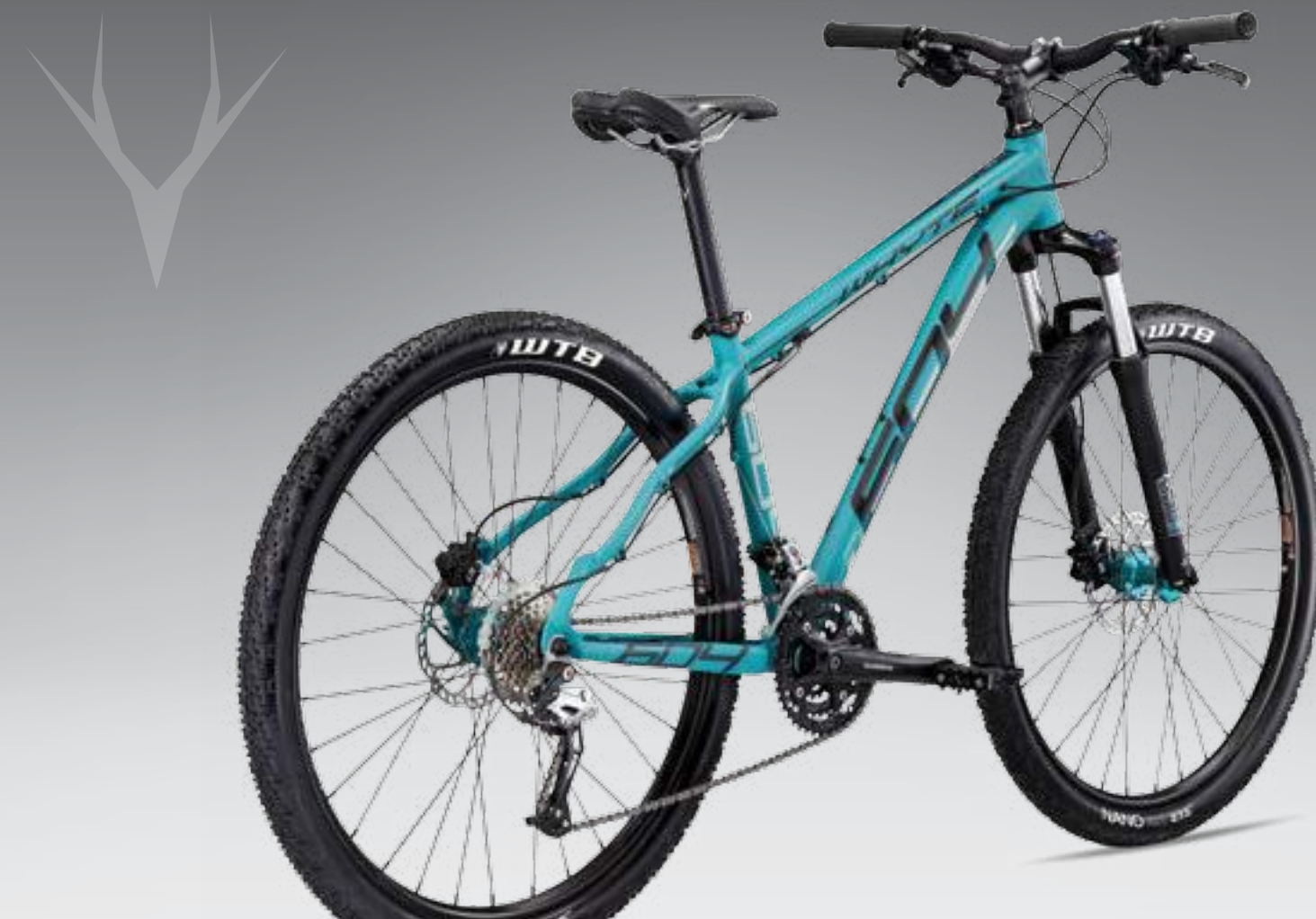
Lightweight aluminium frame with compact geometry for shorter riders / 100mm travel SR Suntour suspension fork / Tektro Auriga hydraulic disc brakes X-6 SPORTS HARDTAIL 650B / 27.5"