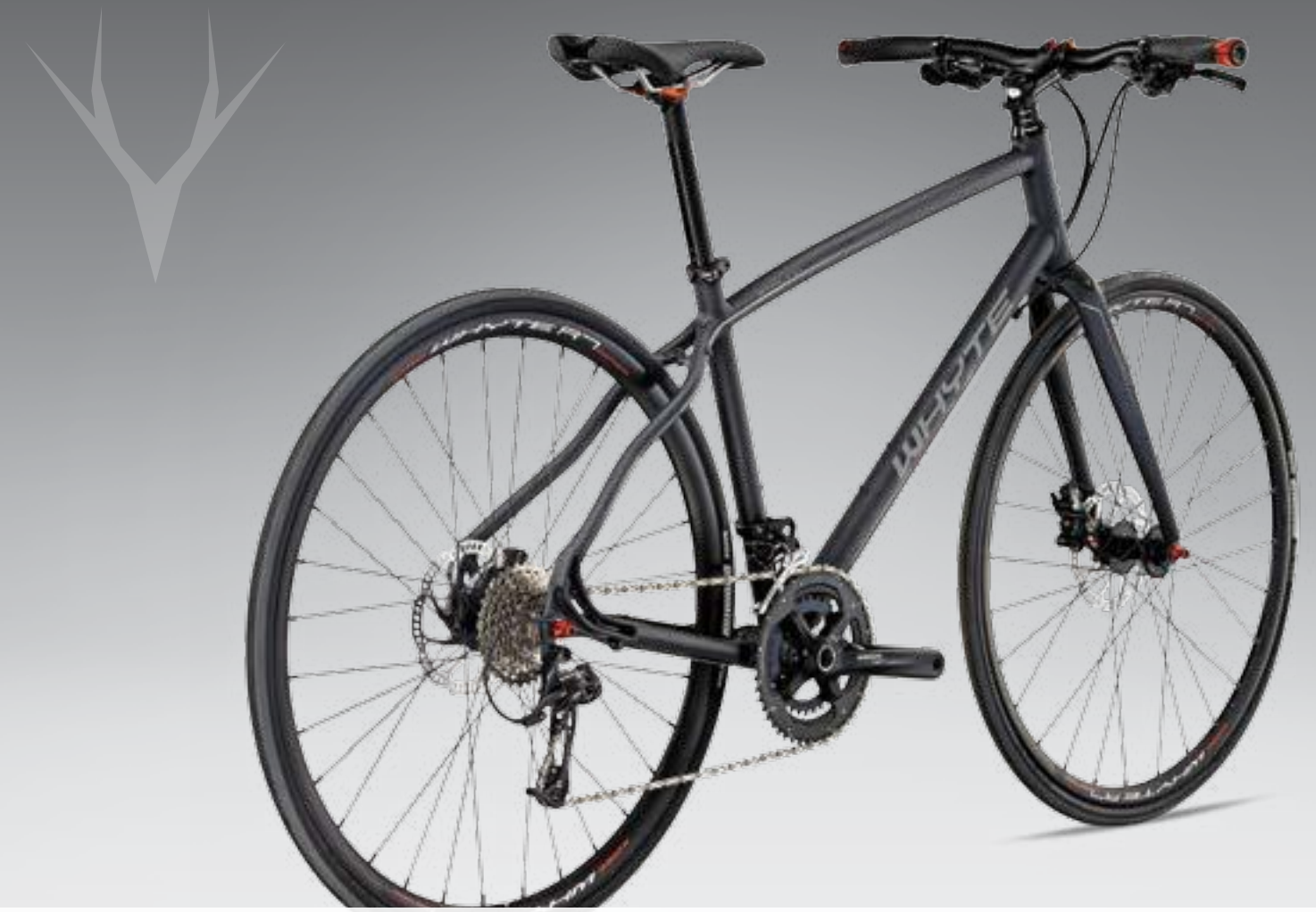
SRAM Via GT urban groupset / lightweight aluminium frame and carbon fibre fork / Powerful Tektro Gemini hydraulic disc brakes R7 FAST URBAN SERIES