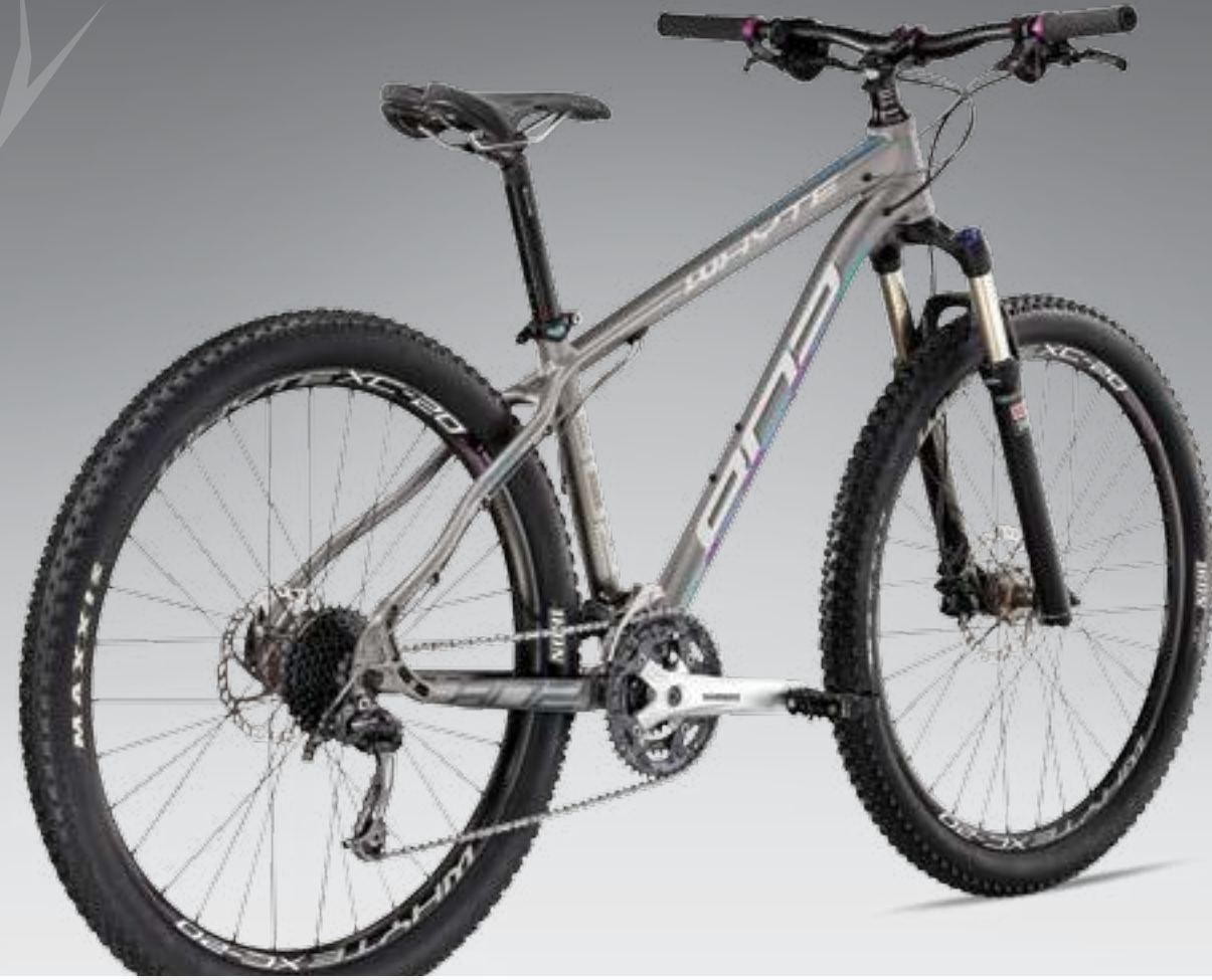
Compact geometry for riders with shorter proportions / Available in sizes extra small to medium / Shorter 170mm cranks as standard / Lightweight hydro formed aluminium frame X-8 PERFORMANCE HARDTAIL 650B / 27.5"