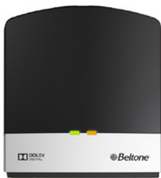
TV Link 2

*TV-Streamer+ is compatible with Beltone Serene™ only. For all other wireless Beltone hearing devices we recommend the TV Link 2.