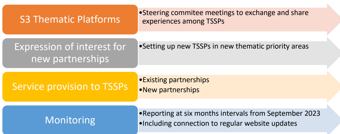
Figure 2: Activities related to Thematic Smart Specialisation Partnerships (TSSPs)

TSSPs and engage in tailored EC support. Further activities are related to TSSPs and include the Call for expression of interest for new partnerships, which is a call and subsequent selection procedure for regions to set up new thematic platforms in priority topics. New and existing partnerships have the opportunity to benefit from services to support their acute needs and development. Monitoring activities take place at six month intervals from September 2023 onwards, related to website updates on the TSSPs. These main activities are outlined in further detail in the chapters below, with a focus on the activities related to the creation of new partnerships.