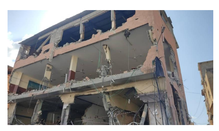
Pictures showing the damage caused by the Israeli missile - Al-Haq's field researcher, 20 October 2023 ©