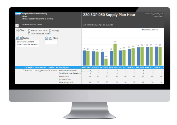
Figure: Screenshots of the SAP IBP Curriculum