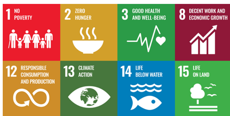
Figure: Major Sustainable Development Goals in relation to PAHW

Since the challenges described above are not restricted to the European continent, networking with international projects and initiatives will be sought and international cooperation developed as much as possible. Interaction with international stakeholders such as OIE, FAO, WHO and UNEP, as well as international research alliances such as STAR-IDAZ International Research Consortium will enable such cooperation.