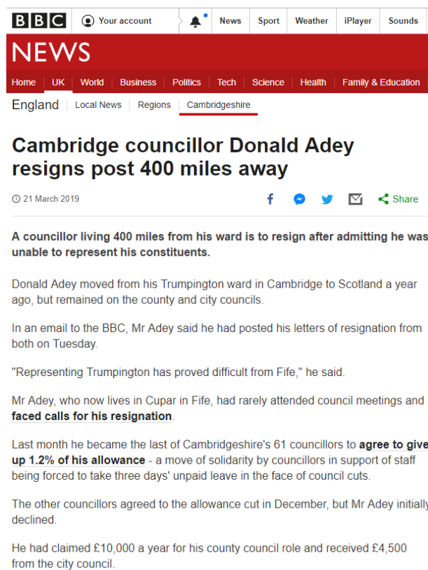
Figure 4: (right) excerpt of BBC online article following councillor resignation.