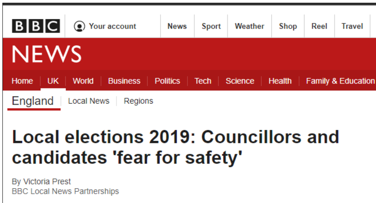
Figure 7: BBC headline example of story aggregation

At the BBC, the partnerships team based in Birmingham is looking for trends in what's being filed by the local democracy reporters to help build aggregated stories that have national significance. In the lead up to the local council elections in Britain in May 2019, individual local democracy reporters were filing stories of how abuse and intimidation have led councillors to fear for their safety with one forced off the road, while another received death threats. Barraclough said a BBC journalist was then able to identify disparate strands and bring together the individual stories and follow up with interviews and case studies for a broader story on the BBC page. 28