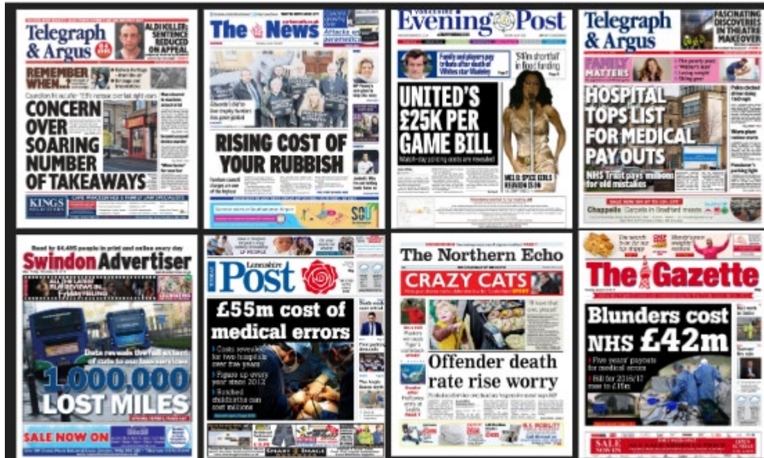
Figure 8: Selection of newspaper front pages relating to data investigations

This shared data journalism has been used widely across the BBC network e.g. 5LIVE and Radio 4 and generated more 650 local news stories across the UK, some of which have been front page news splashes.