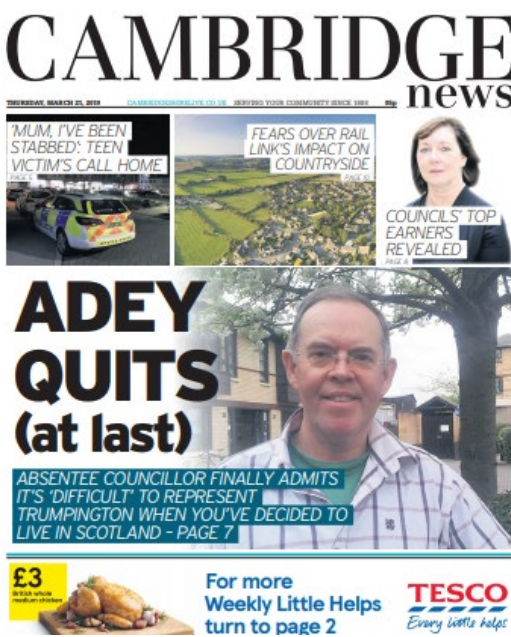
Figure 3: (above) Cambridge News article by former Local Democracy Reporter Josh Thomas

“Effectively this pressure on National Government is directly as a result of the LDR covering the story with real world impact: resignations, massive coverage bringing an issue to light and eventually the government itself being put under pressure to close a loophole,” (interview Barraclough 2019).