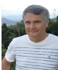
Janusz Pawliszyn (University of Waterloo - Canada)

Peptide quantification at the picomolar level in volume-limited biological samples: obstacles to tackle