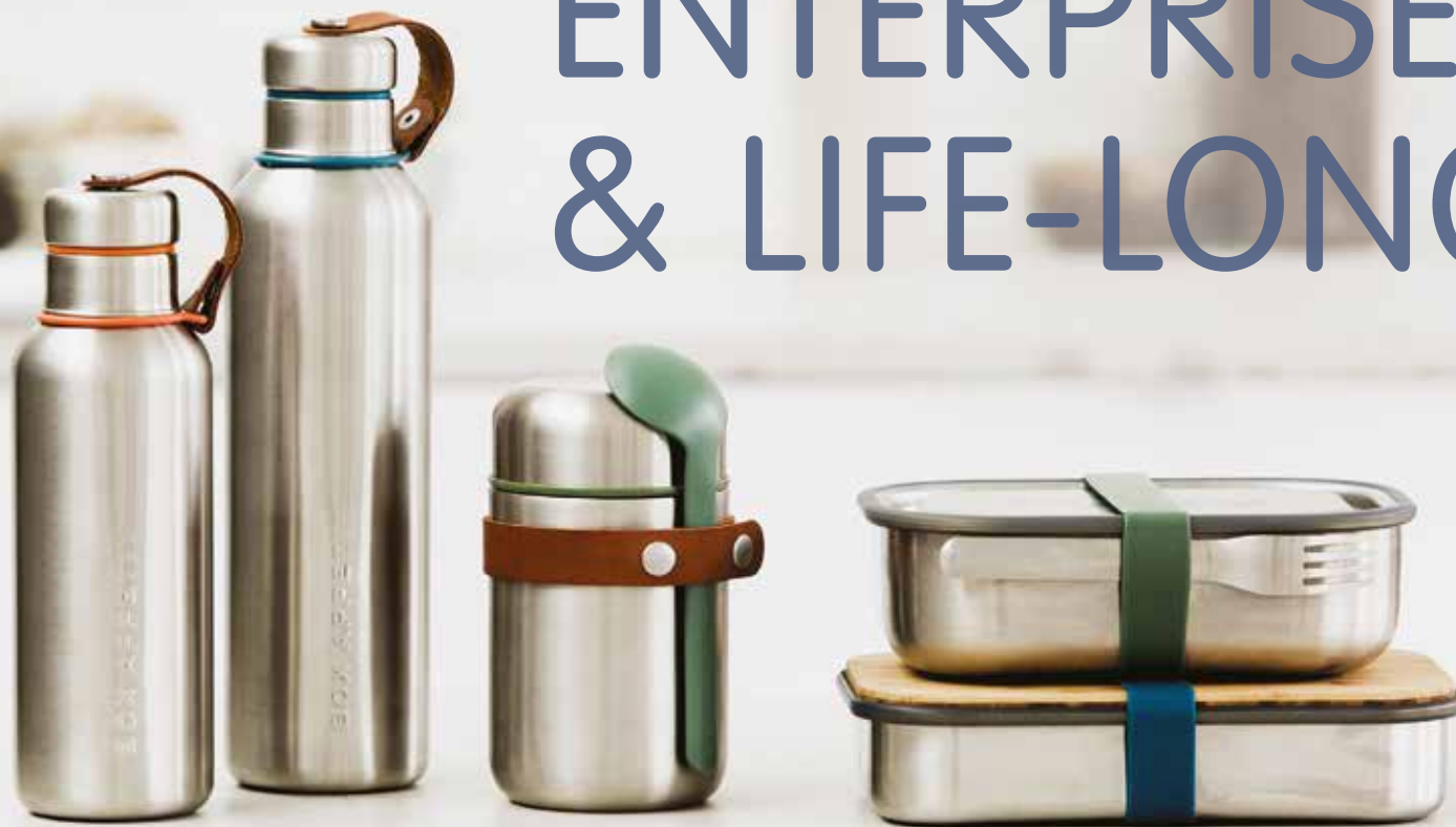
Stainless steel 'food on the go' products by Black + Blum

We also give people of all ages and backgrounds the chance to get creative.