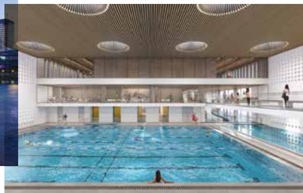
CGI of 8-lane 25m main pool plus learner pool

When we set up our organisation in 1984, the greatest threat to our neighbourhood came from the rapid loss of residential population and the closure of shops and schools.