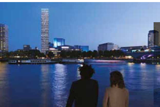
CGI of residential development from north bank