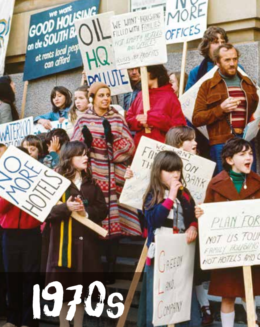
Protest at County Hall, 1977