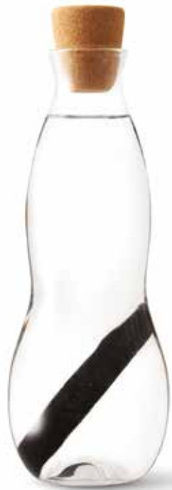
Charcoal filter water bottle by Black + Blum