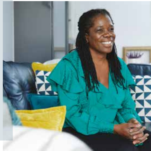
Clockwise from right: Iroko Housing Co-op, Palm Housing Co-op, Mulberry Housing Co-op