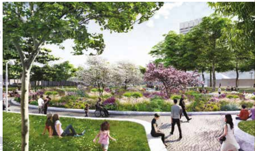
CGI of proposed pollinator garden design by West 8