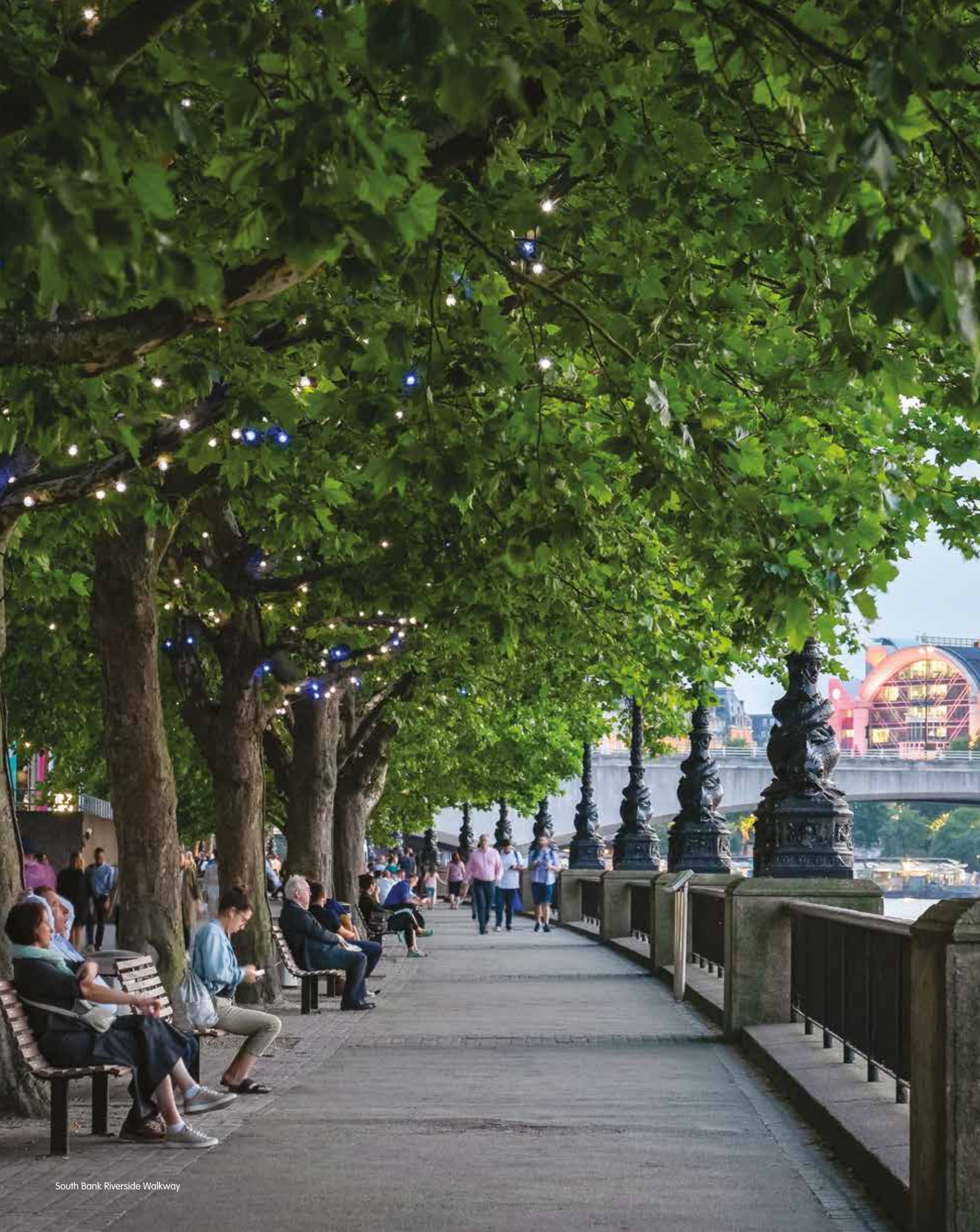
South Bank Riverside Walkway