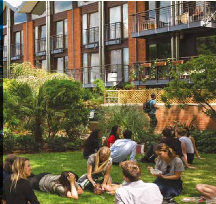
Bernie Spain Gardens (south)