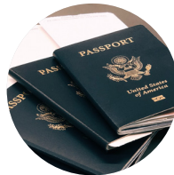
Lost Passport Recovery