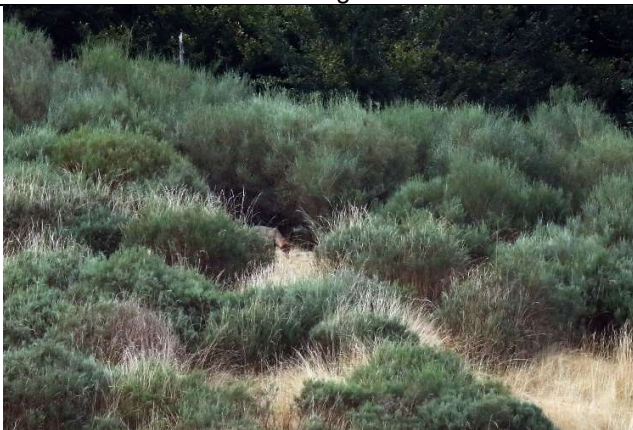
Wolf (can you see it ☺ ?)