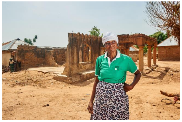
Tudun Adabu, Nigeria

Fragile social contracts are further eroding where COVID-19 is seen by local populations as an opportunity for corruption, incompetence, and exclusive or repressive behavior by governments. In some countries, the inability or unwillingness of the state to respond to citizens' needs, and the diminishing ability of civil society to hold authorities accountable, is deepening mistrust and legitimacy gaps and