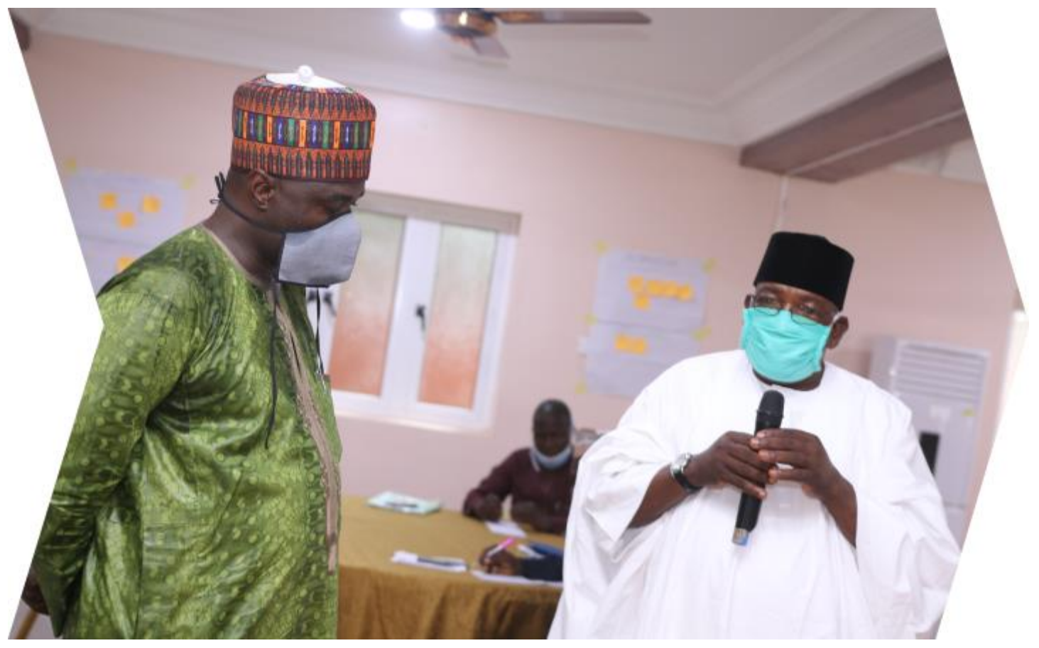
Kaduna, Nigeria