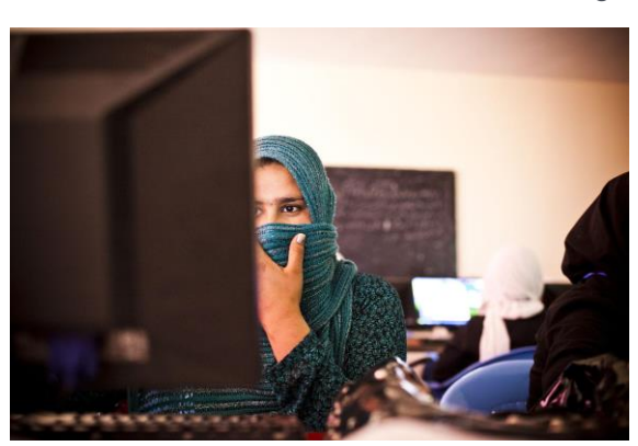
Helmand, Afghanistan

The widely discussed "infodemic"—in which people spread incorrect information unintentionally (misinformation) or intentionally (disinformation)—not only hampers public health outcomes, but also contributes to inflaming fears and misperceptions across groups, while deepening mistrust of government officials and health experts. Data collected by researchers at Princeton University indicates that COVID-19 disinformation is rife and covers a wide range of topics, from the nature and origins of the virus to unproven