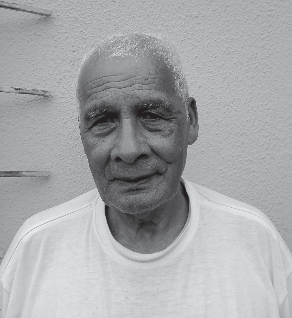
Frederick de Kock